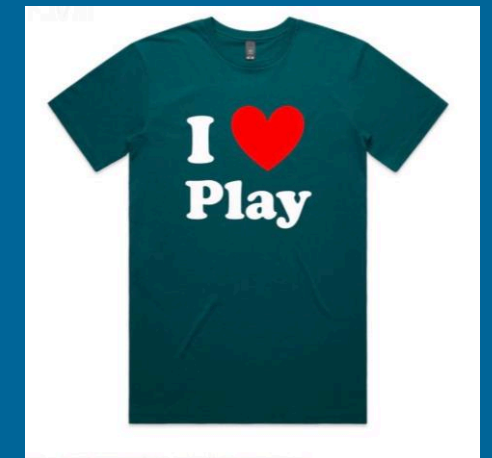
Limited edition tees