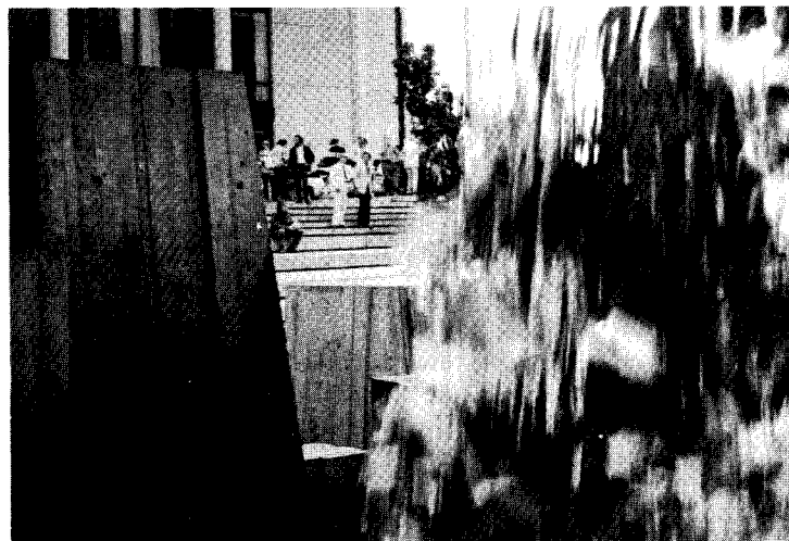
Below: human interaction and involvement with water at Portland Auditorium forecourt, its refraction, beading, noise. Liquids, gases (waterfall, wind tunnel) afford classic examples of how loose parts permit experimentation, creativity.